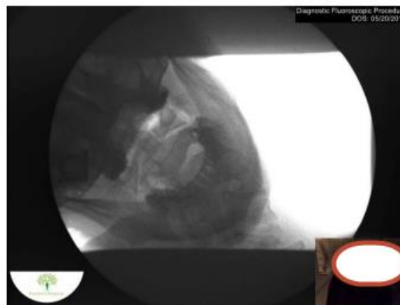
Open mouth left lateral bending