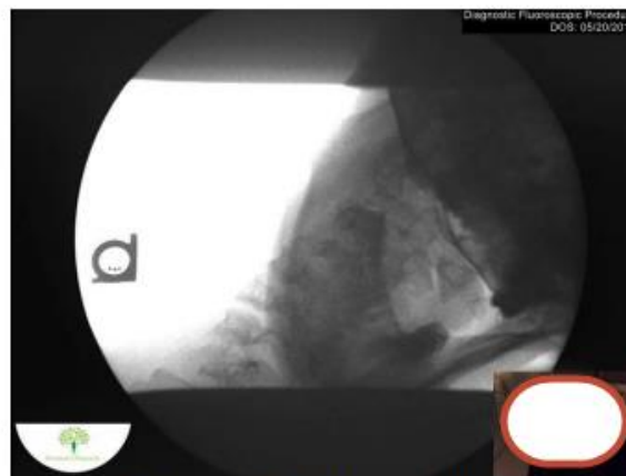
Open mouth right lateral bending